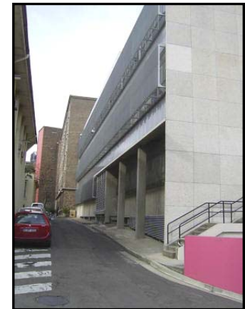
Griffith Taylor Building